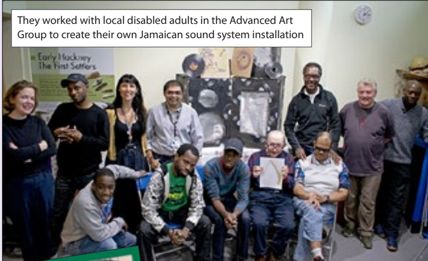
They worked with local disabled adults in the Advanced Art Group to create their own Jamaican sound system installation