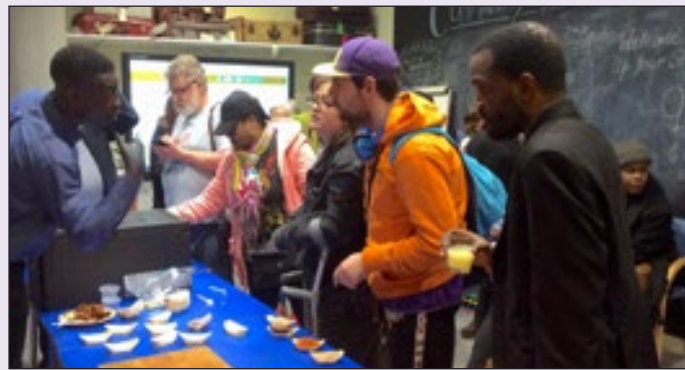
◀ They shared their sensory objects and retold the stories that inspired their creation