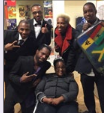
▲ The STARS worked with Hackney rapper Badladee to provide workshops for local school children at the exhibition