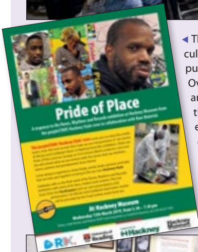
◀ Their work culminated in a purpleSTARS Take Over event with food and performance on the last day of the exhibition, which coincided with World Disabled Access Day